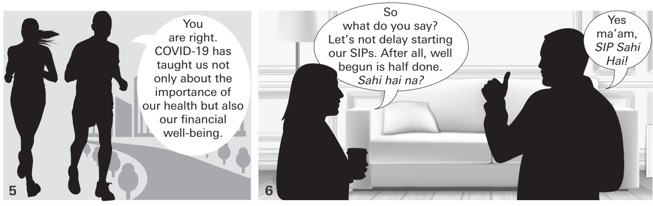
An investor education initiative by HSBC Mutual Fund