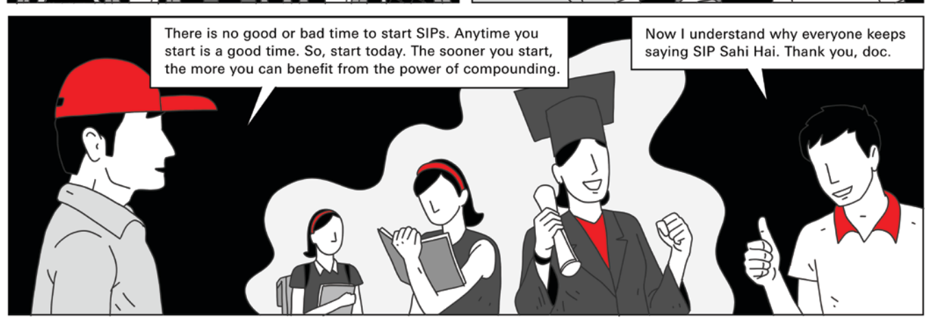
An investor education initiative by HSBC Mutual Fund